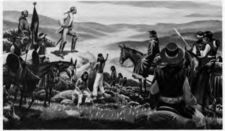
On July 23, 1769, Portolá's men camped in San Juan Canyon, near future Mission Viejo adobe, and named site Santa María Magdalena.