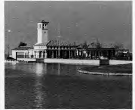
Beach Club on Lago Santa Margarita reflects early California style of urban village now unfolding on historic Trabuco Mesa.