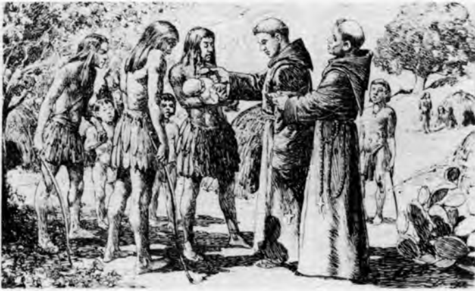
California's first christening took place in Orange County on Rancho Mission Viejo, July 22, 1769, with baptism of two Indian babes.